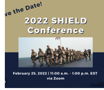
2022 SHIELD Conference