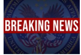
VA News Release